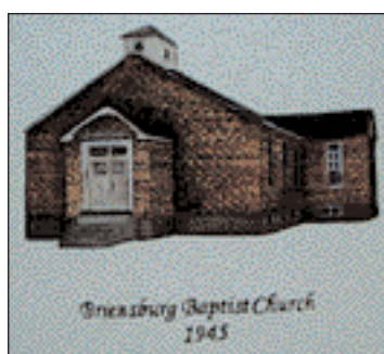
Briensburg Baptist Church 1945