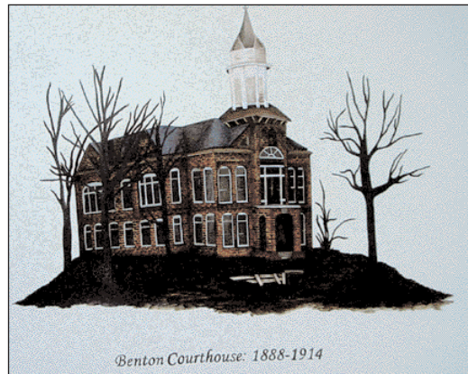
Benton Courthouse: 1888-1914