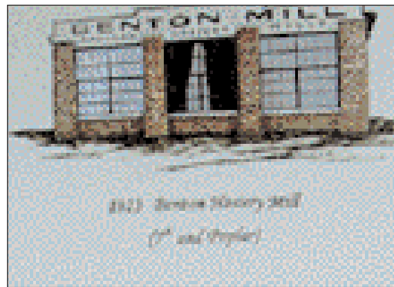
Benton History Mill (1st and Poplar)