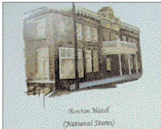
Benton Hotel (National Stores)