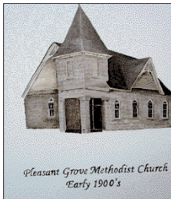
Pleasant Grove Methodist Church Early 1900's