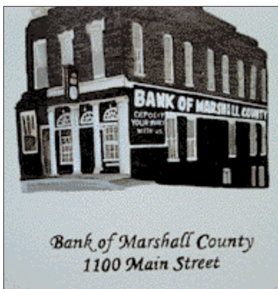
Bank of Marshall County 1100 Main Street